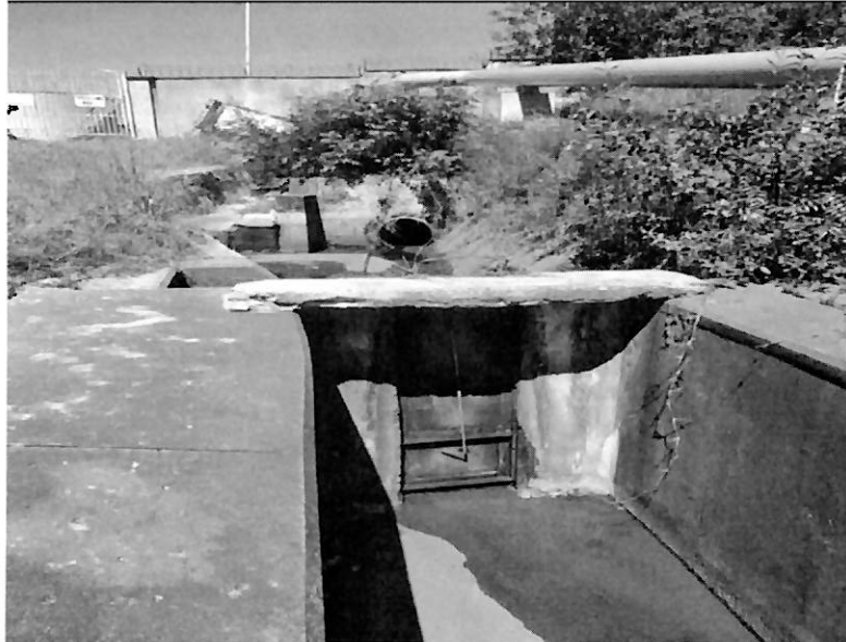
PS14 ( Kipevu- Mombasa) Sluice Gate