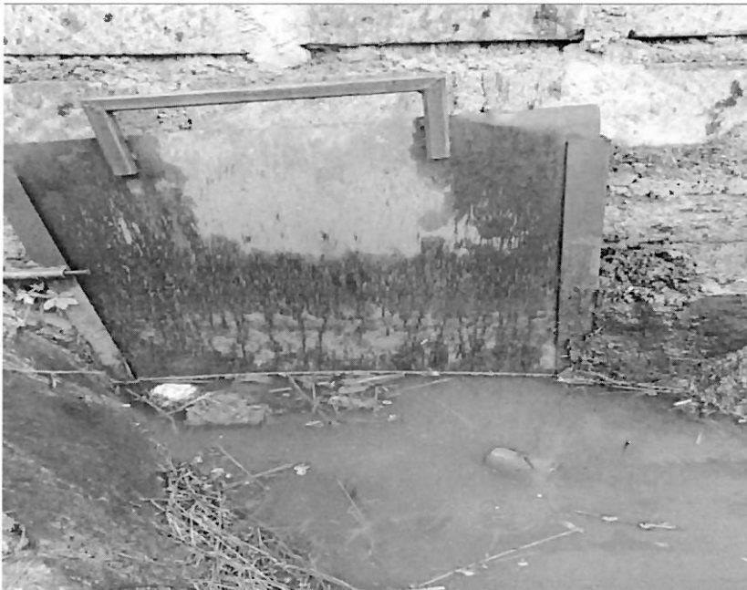
PS25 (Nakuru) Sluice Gate